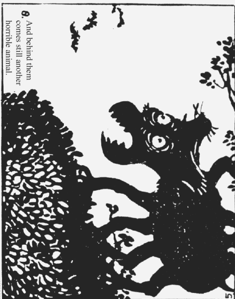
8. And behind them comes still another horrible animal.

But now they hear a screech that sends Lovekins jumping up about ten feet in the air. Then there is a crunching and a snorting, and a pit-a-pat of heavy feet.