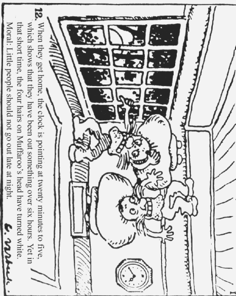
12. When they get home, the clock is pointing at twenty minutes to five, which shows that they have been out something over six hours. Yet in that short time, the four hairs on Muffaroo's head have turned white. Moral: Little people should not go out late at night.

Turn the page to the right to read the first part, then turn it upside down to continue the story.