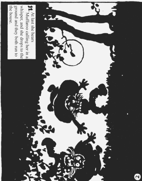
11. At last she hears Muffaroo calling her in a whisper, and she drops to the ground and they both run to the house.

Lovekins and Muffaroo are sitting in the window-seat, looking out at the moon. It is ten minutes past ten, and rather late for little people to go out, but Lovekins wants to go.