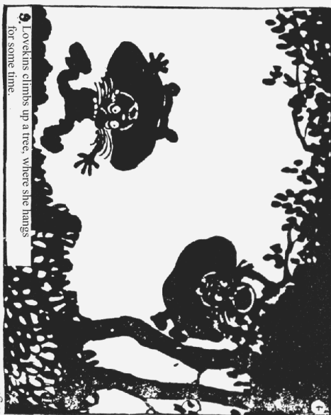
9. Lovekins climbs up a tree, where she hangs for some time.

A tall man with a large hooked nose leans over. "Muffaroo, there is a Squeedlejunk coming," says he, and then he vanishes like a ghost. All of this is very awful indeed.