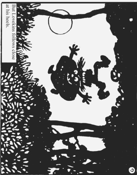
6. But Lovekins follows close at his heels.

And along comes the worst-looking animal that they have ever seen.